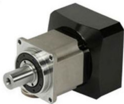
GEARHEAD, HELICAL, 10:1 (METERING PUMPS)